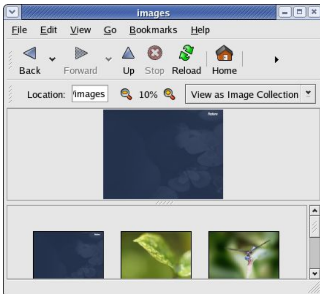
Fig. Image Collection View in File Manager

The File Manager itself provides a simple and convenient means to access and view image files. To view an image file from the File Manager, navigate to the folder containing the file and double-click on it. If a folder contains image files, you may also set the "View as Image Collection" option from the View menu selection.