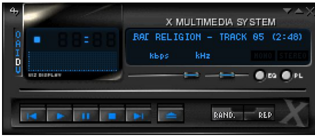
Fig XMMS Player using a Different Skin

to choose the skin you want. Experiment until you find a skin to your liking.