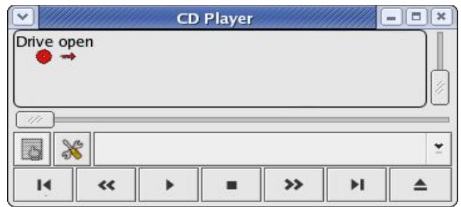
Fig. CD Player

Main Menu --> Sound & Video --> CD Player