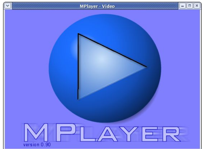
Fig. Mplayer Video Screen

The control screen enables you to control the operations of Mplayer while the video screen displays any video that is being played. In addition right-clicking on the mouse when it is inside either the control or video screens will also bring up a menu for controlling the use of Mplayer.