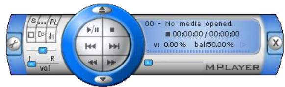
Fig. Mplayer Control Screen

On start up, the main Mplayer control screen and the Mplayer video output screens are displayed.