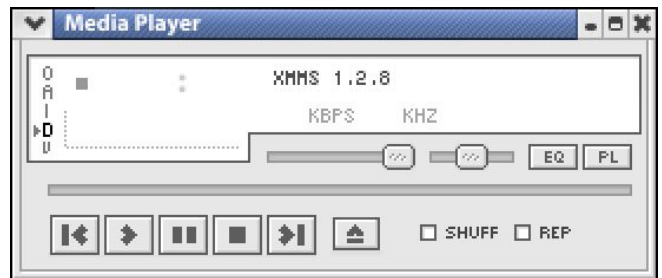
Fig. XMMS Player

Main Menu --> Sound & Video --> Audio Player